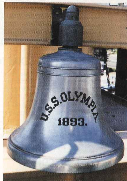
Though the Olympia's keel was laid in 1891 and she entered into service in 1895, the original ship's bell bears the date 1893, a reference to the date of her launching.

man in the age of the old steam navy. From cooking, 5-inch gun drill, sword practice and signaling, the crew makes life for both the visitor, and the crewmen themselves, as close as anyone might come to experiencing things as they once were.