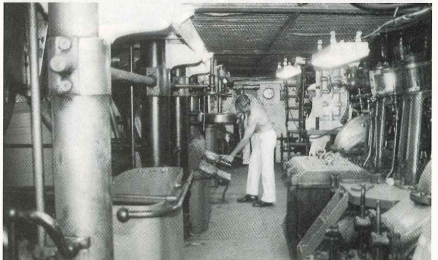
The fluorescent lights and the large clock in the background are the only signs that this isn't a period photograph taken in the ship's engine room.