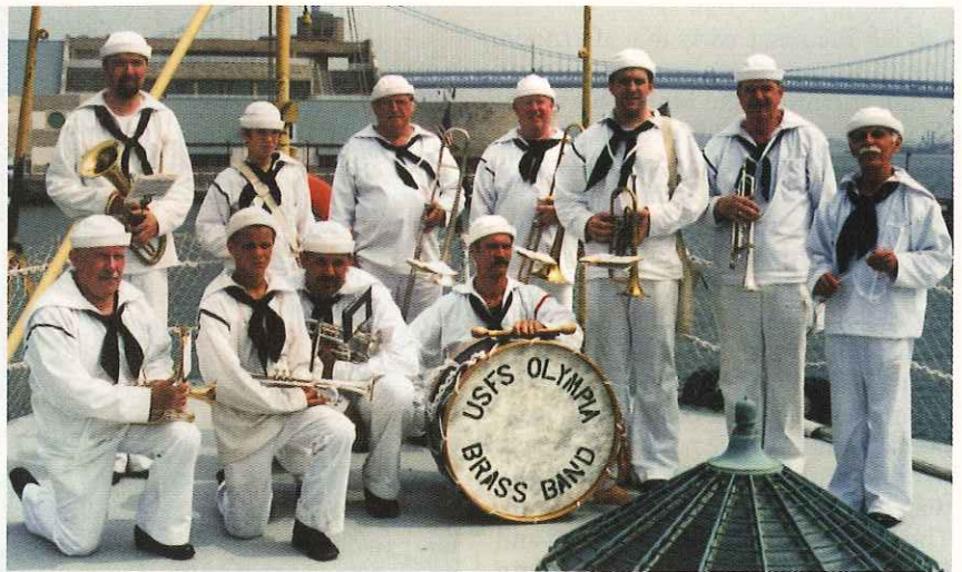
The first living history crew on the Olympia in 1996 was a re-creation of the ship's band. Though still active today, crew members participate in numerous activities other than music.