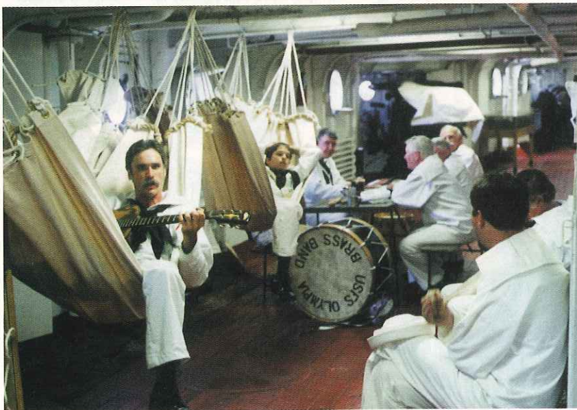
Olympia's crew during a few moments of relaxation. Crew members hand make each of the hammocks, and the musical instruments are original to the late 1890's.