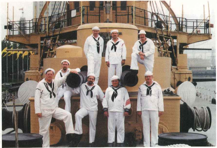
The ship's company on the forward 8-inch gun turret. Uniform for the day is "working whites" one of the most comfortable living history impressions available.

She later served the first part of the 20th Century in the Carribean, Atlantic and Mediterranean. In 1916 she was named flagship of the Atlantic Fleet and participated in the Great War, eventually participating in the