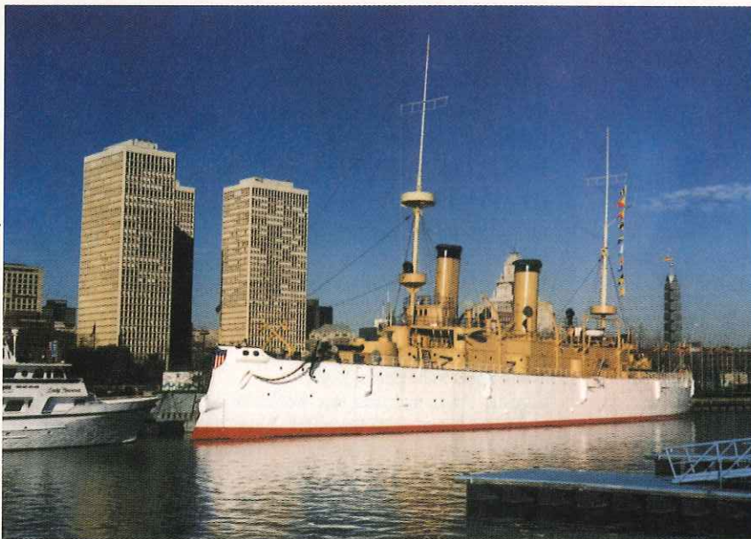
The Olympia today sits at Philadelphia's Penn's Landing in a slip on the Delaware River, just opposite from the newly berthed USS New Jersey.

On a number of weekends during the calendar year, the Olympia springs to life with the aid of a living history crew who demonstrate life as it was aboard the ship in 1898. Comprised of nearly 30 crewmen, and officially known as the Living History Crew of the USFS (US Flag Ship) Olympia, the crew strives to display numerous aspects of how it was to live as a crew-