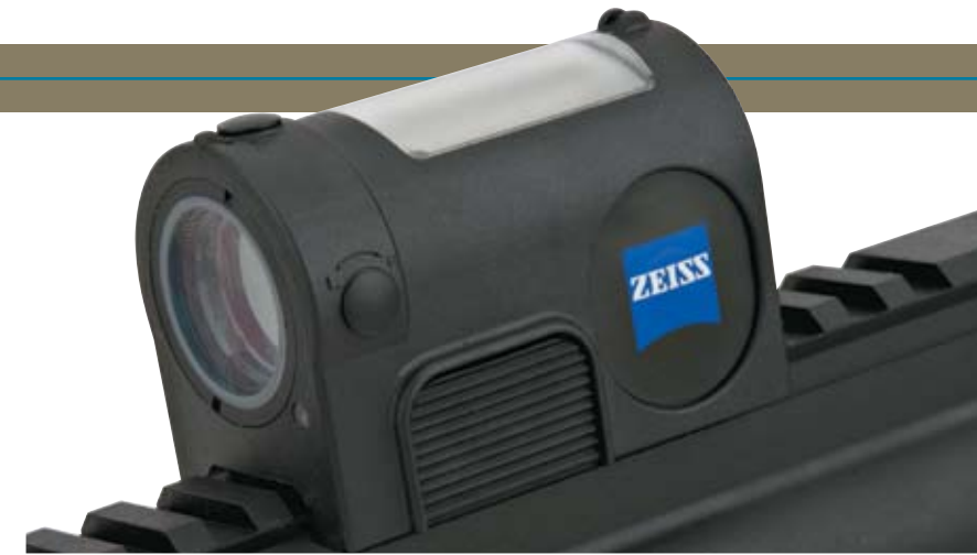
The Z-Point sight is powered on and off, and its dot brightness is regulated by way of the single Zeiss banner button (above), which is located on the unit's left side.