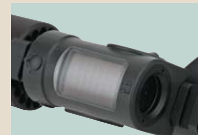
The Z-Point utilizes a hybrid power supply that employs both a lithium battery and a solar cell.