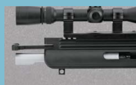
There is no dust cover on the Panther 308's upper receiver as DPMS believes one is not necessary on a rifle of this type.