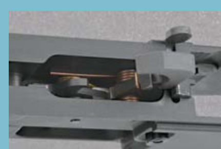
The fire-control parts are standard DPMS A-15 parts, including the hammer, sear, bolt stop safety and trigger.