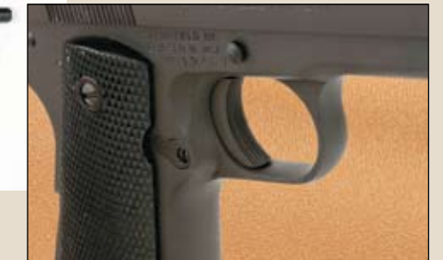
The frame (above) has the finger cuts and the shorter trigger of the original M1911A1 (as compared to those of the the U.S. M1911), and our test gun's single-action trigger broke at a crisp 4½ lbs.