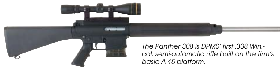
The Panther 308 is DPMS' first .308 Win.-cal. semi-automatic rifle built on the firm's basic A-15 platform.

D PMS began life in the mid-1980s as Defense Procurement Manufacturing Services, Inc., acting as a consultant and manufacturer of military rifle components for the Department of Defense. DPMS now offers to the civilian market just about every conceivable variation of its .223 Rem. A-15 rifles from tactical versions to full-blown match guns to plinkers, as well as .22 LR uppers and whole guns on the A-15 platform. And now, it steps up to the .308 Win. chambering with its Panther .308.