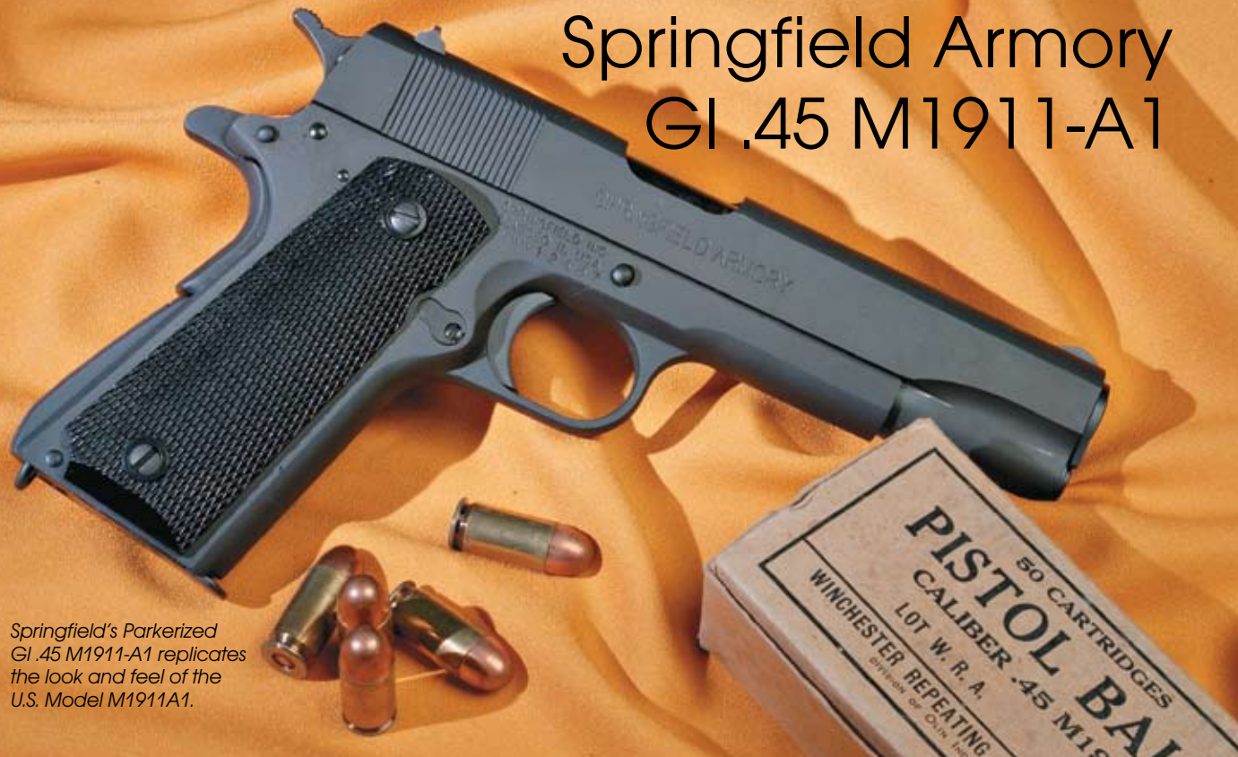
Springfield's Parkerized GI .45 M1911-A1 replicates the look and feel of the U.S. Model M1911A1.

With the end of World War II, production of U.S. M1911A1 pistols also ceased. In recent years, interest in and the collectibility of vintage M1911A1 pistols in original condition has increased, and the prices for World War II-issue guns has steadily climbed. Demand was such that production of replica World War II G.I.-style M1911A1 pistols has been undertaken by quite a few firms—the most recent of which is Springfield, Inc., and its GI .45 M1911-A1.