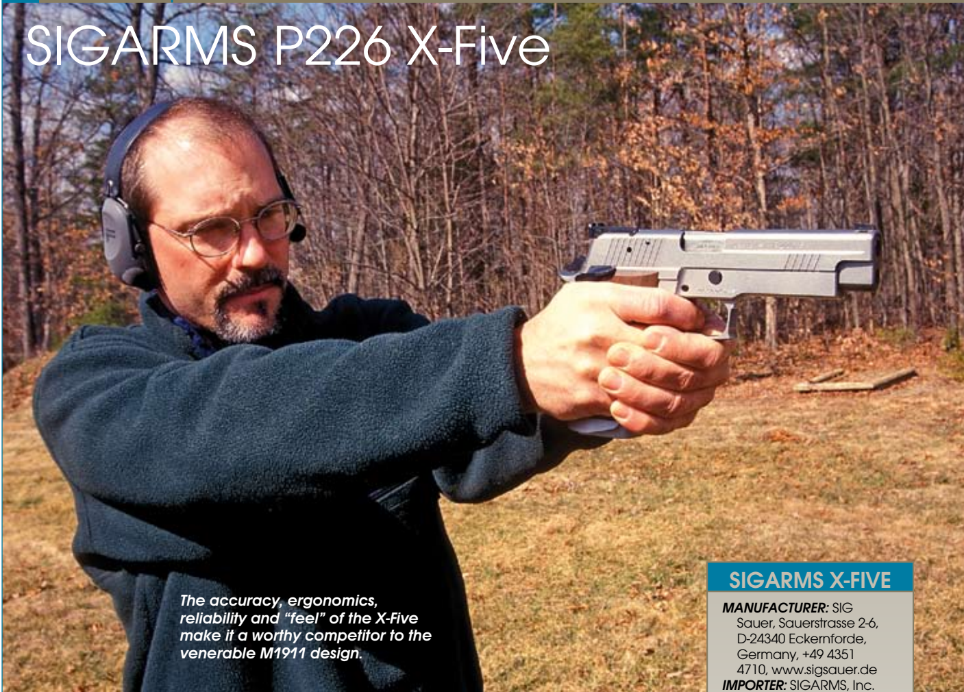
The accuracy, ergonomics, reliability and "feel" of the X-Five make it a worthy competitor to the venerable M1911 design.

Single-action semi-automatic handguns are de rigeur among practical shooting aficionados primarily because they allow the skilled shooter to deliver an accurate first shot faster than other pistol types. Accordingly, the M1911-style pistol dominates every practical pistol sport in which it is used. In late 2004, however, SIGARMS brought the new single-action semi-automatic P226 X-Five to American shores as an alternative to that venerable design.