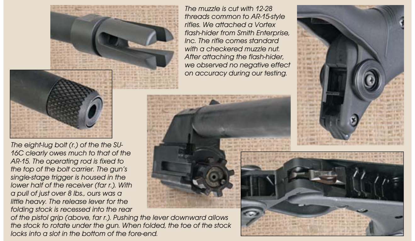
The muzzle is cut with 12-28 threads common to AR-15-style rifles. We attached a Vortex flash-hider from Smith Enterprise, Inc. The rifle comes standard with a checkered muzzle nut. After attaching the flash-hider, we observed no negative effect on accuracy during our testing.

to the gun's testing regimen. There were no malfunctions of any kind. Accuracy results are shown in the accompanying table. The stock of our test gun locked securely in place when extended, and though it looks like the stock has just a top half, it had enough surface area for a good cheek weld. No studs or loops are provided for attaching a sling, so backcountry adventurers on foot may find that limits its utility, but those in search of a reliable .223 Rem. carbine that can be stored in a small space for predator control, survival or self-defense need look no further because the Kel-Tec SU-16's compact dimensions make it a useful accessory for a ranch truck, boat or small plane.