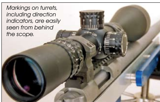
Markings on turrets, including direction indicators, are easily seen from behind the scope.

absorbing, strain-free and zero-movement lens bed.