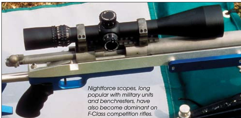
Nightforce scopes, long popular with military units and benchresters, have also become dominant on F-Class competition rifles.

All air-to-glass surfaces receive a proprietary abrasion-resistant broadband coating that maximizes light transmission. Lenses are mounted using not only O-rings and metal lock rings, but also a proprietary bonding agent that provides a shock-