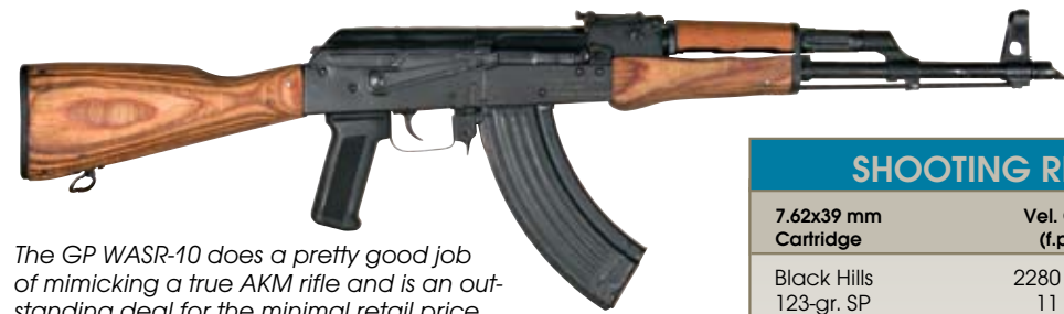
The GP WASR-10 does a pretty good job of mimicking a true AKM rifle and is an outstanding deal for the minimal retail price.

The GP WASR-10 does a good job of mimicking the appearance of a true AKM rifle and all its requisite